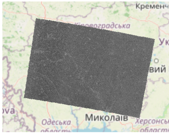
Figure 2: Without ThermalNoiseRemoval node